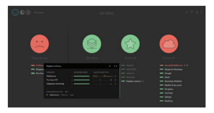
Figure 2: Aruba User Experience Insight: Administrator Dashboard

Mobile devices and IoT have become mission critical for the digital business and must be always-on with real-time access to applications and network services. To achieve this, IT needs a simple way to continuously monitor, measure, and track the complete end-to-end experience for all users or IoT devices. Aruba User Experience Insight (UXI) provides user and IoT device application assurance and rapid troubleshooting through easy-to-deploy sensors. By simulating end-user activities with admin-defined frequency, UXI sensors continuously perform user-centric application testing and store captured analytics for up to 30 days.