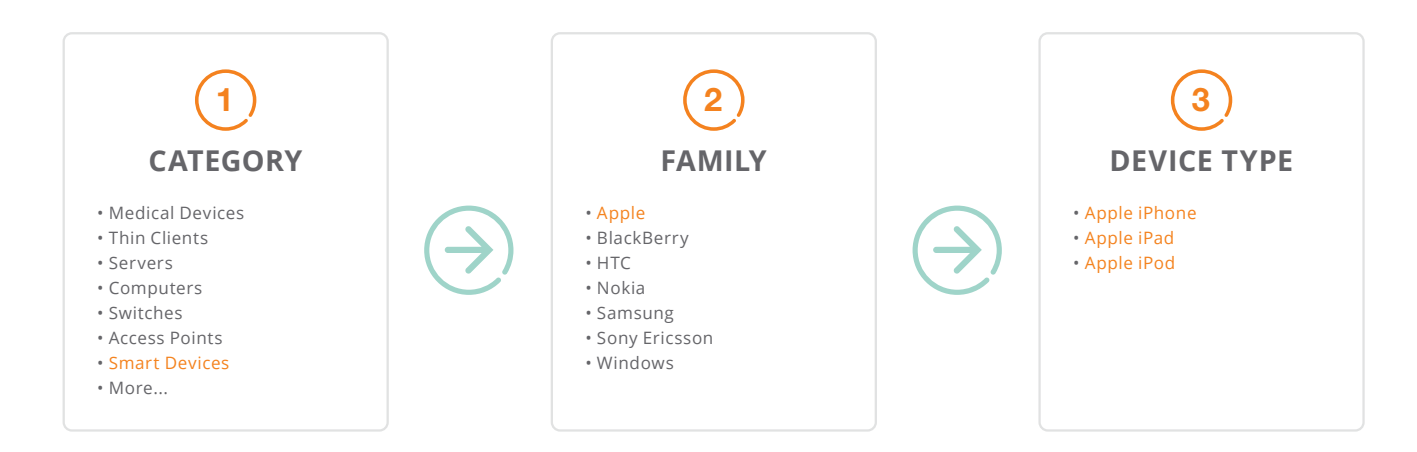
Figure 1: Granular visibility by device category, family and type

ClearPass discovers endpoints with unsurpassed ease, identifying and profiling attributes that determine device category, vendor, operating system, IP address, hostname, owner, and more. Automatic and IT-customizable endpoint classification ensures that new and unknown IoT devices are quickly placed into the proper device families for visibility and/or security enforcement.