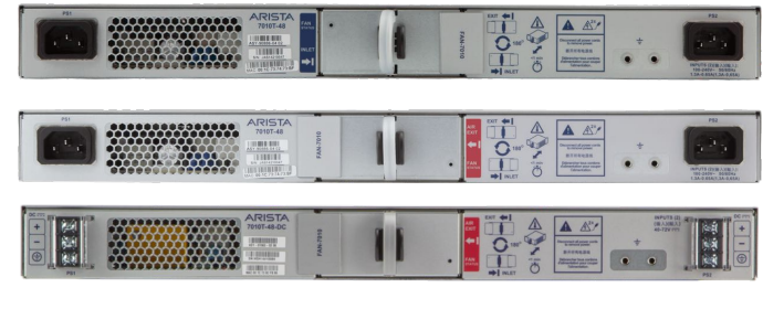
Arista 7010T Rear View - reversible airflow, AC & DC