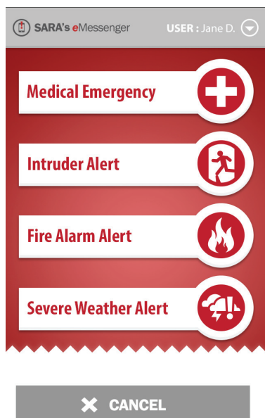
Mobile dashboard with various alerts

SARA's modes and actions automatically set alerting/mass notification in motion when a triggering event occurs, according to your protocols and escalation paths. Because of our expertise in computer-telephony integration (CTI), we can make your existing networks, devices and other software systems work together, not in silos, to enhance life safety, security, environmental monitoring and mass notification. Such interoperability also means that legacy technology investments don't have to be ripped out and replaced. In fact, their utility usually is expanded through integration with SARA.