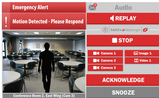
Desktop alert with video paging

awareness transactions — alerts — are delivered to the people who need to know what's happening, where it's happening, and how to respond. Following the discovery process, we'll determine the best design for your customized situational awareness framework to produce the specific outcomes you require.